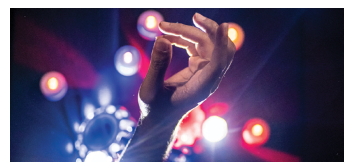
Publicity image from Arms of Love workshop