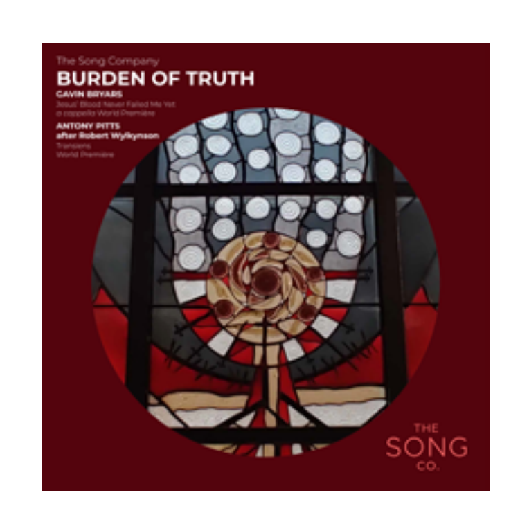
2021 Album Releases