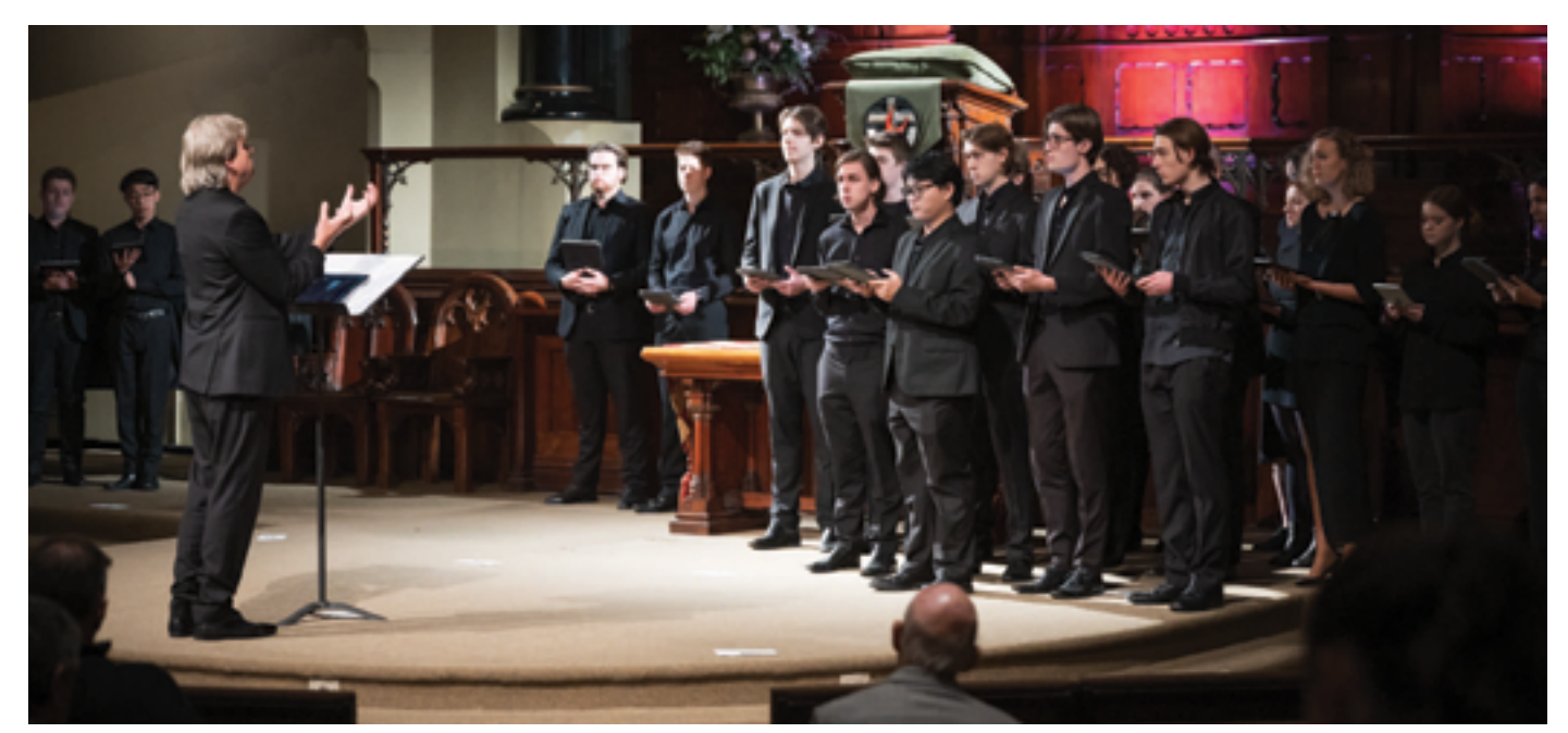
(This page) Burden of Truth, Melbourne