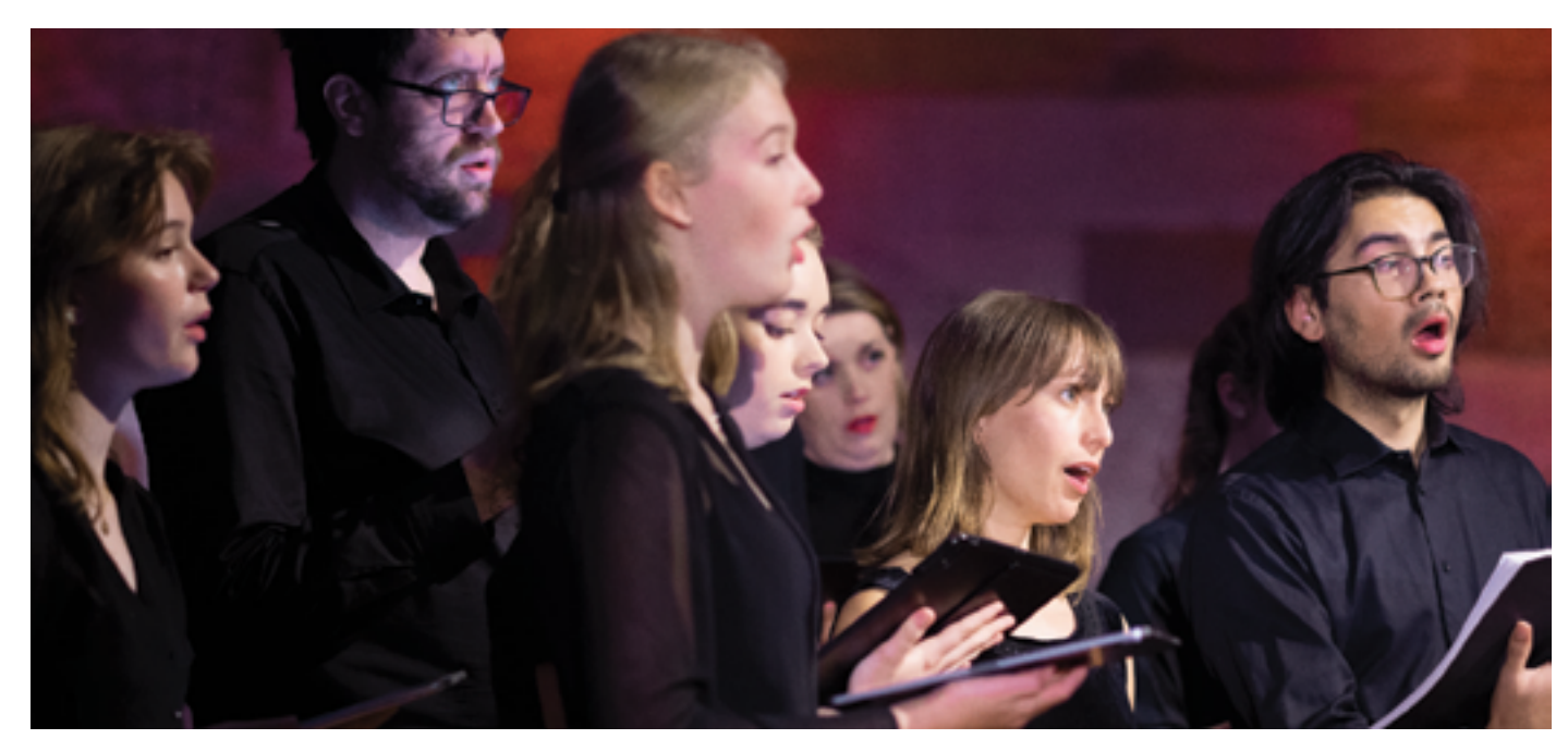
(Above and below) Burden of Truth, Cell Block Theatre, Darlinghurst