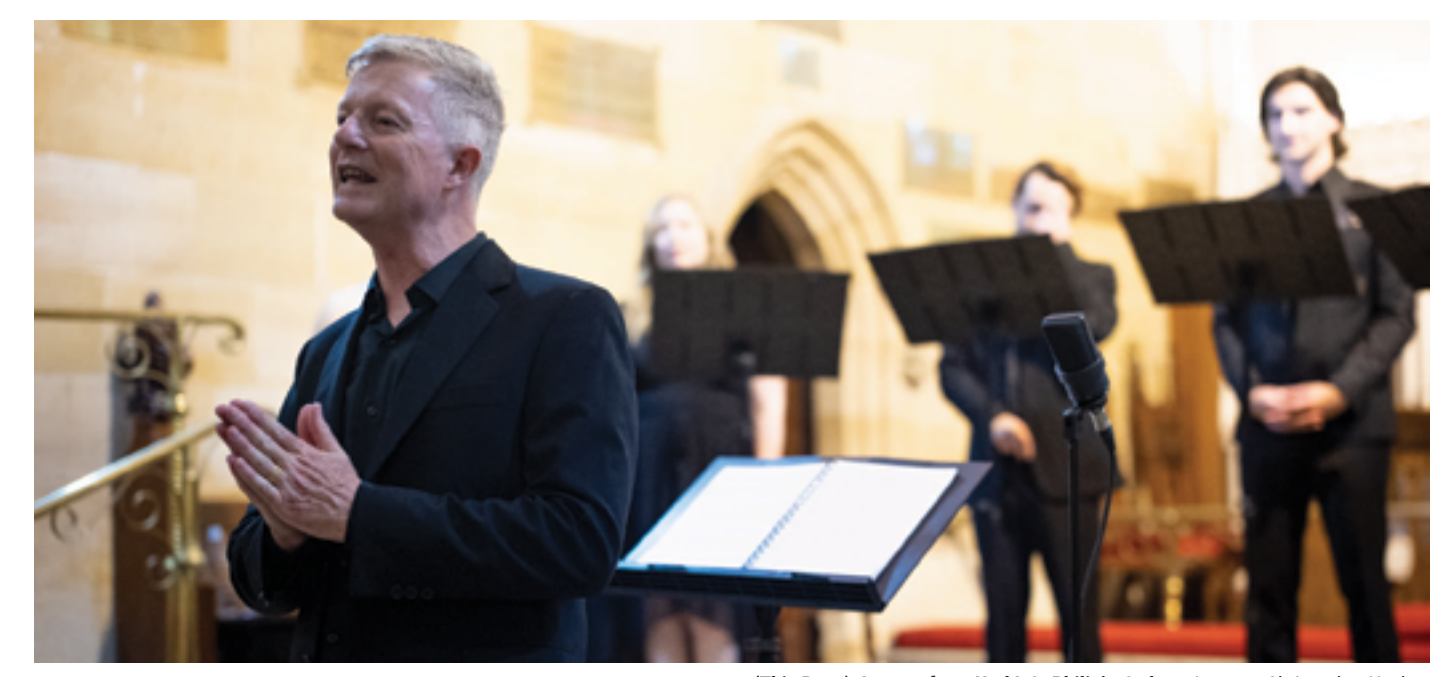
(This Page) Images from Hark!, St Philip's, Sydney